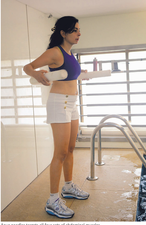
Aqua noodles targets all four sets of abdominal muscles