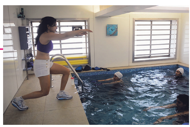
Squats help tighten the gluteal muscles