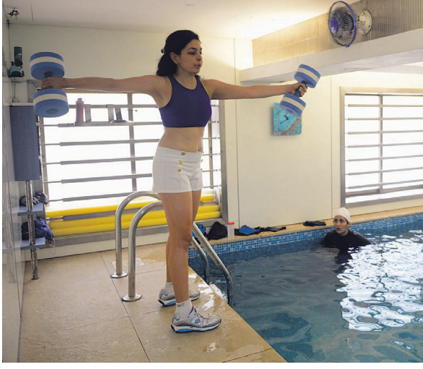
Upper body workout using aqua bells